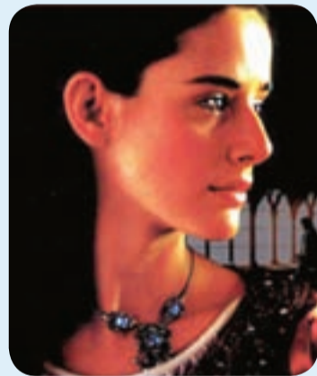
'Mad Love,' Spain

And it looks like for many film aficionados, their wish to have a taste of Europe and its culture is just a cinema away. ■