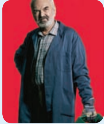
'Empties,' Czech Republic