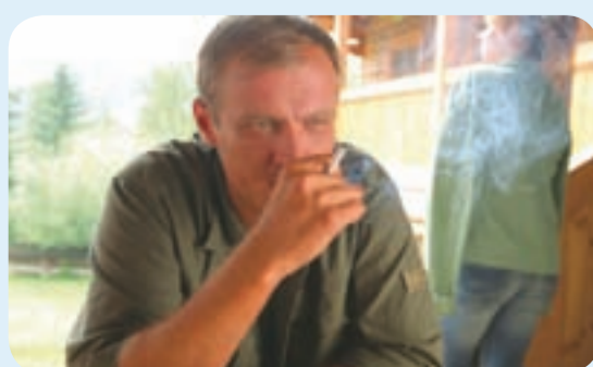
'Soul at Peace,' Slovakia