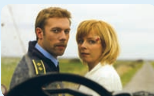
'Terribly Happy,' Denmark