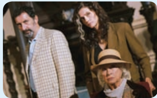
'Toward Zero,' France