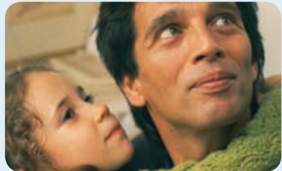
'All is Forgotten,' France