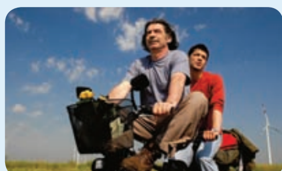
'The World is Big & Salvation Lurks Around The Corner,' Bulgari