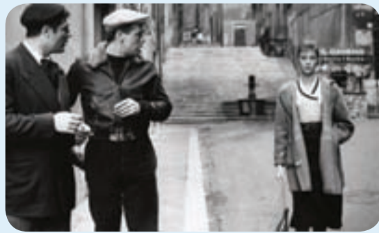
'Persos Unknown,' Italy