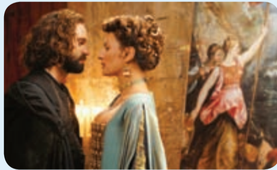
'El Greco,' Greece'