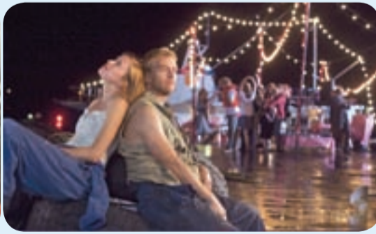
'Hannahannah,' The Netherlands