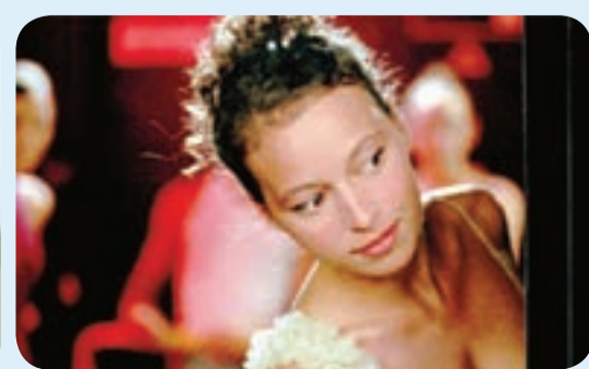
'The Kiss,' Belgium