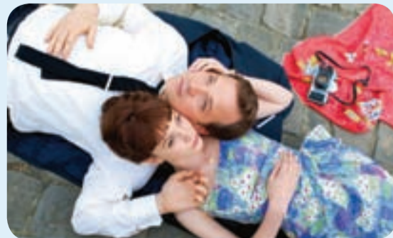
'An Education,' United Kingdom