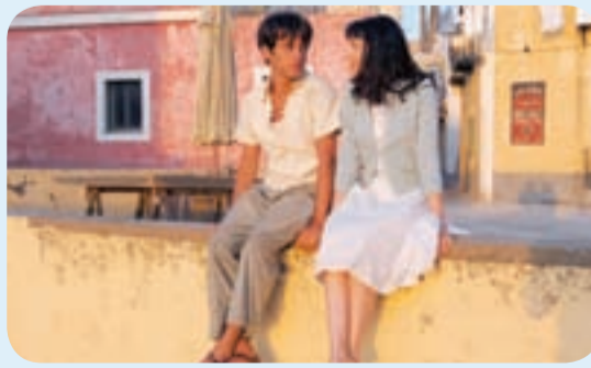
'Marcello Marcello,' Switzerland